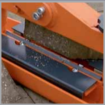
Heavy Duty Blades For Accurate Cutting