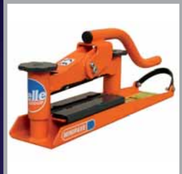
Compact Design For Working At Floor Level