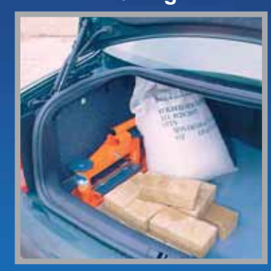
Fits Into The Back Of Any Car With Ease