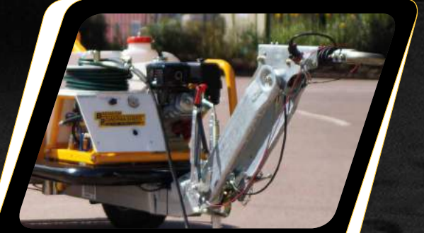
Choice of 50mm Ball or Eye couplings - Alko Adjustable Hitch available