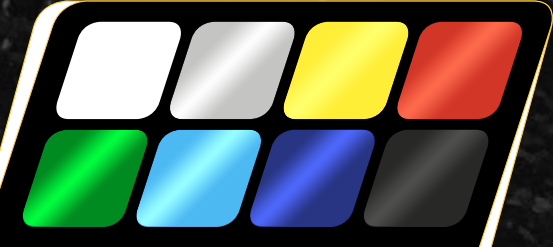
Large choice of Tank & Chassis Colour Combinations