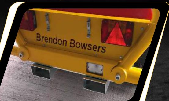
Optional Extra: Rear Forklift Points