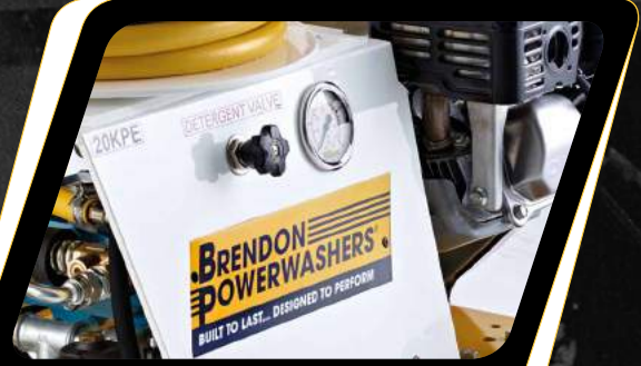
Polypropylene Canopy with Detergent Control Valve and Pressure Gauge