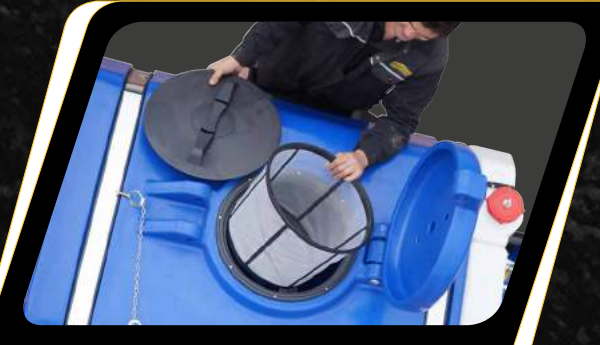
Lockable Hinged Tank Lid with removable Basket Filter