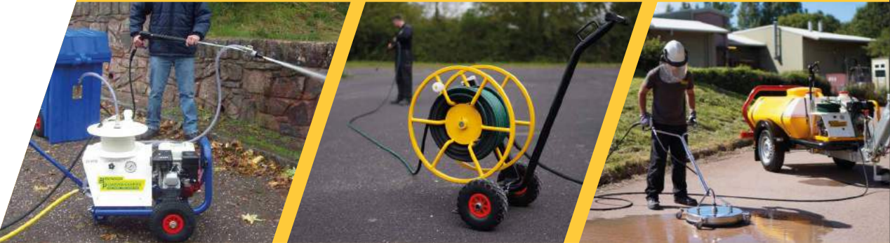
Community Design No. 000235429

WET SANDBLASTING MOBILE HOSE REELS SURFACE CLEANERS