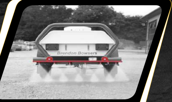
Optional Extra: Rear mounted spray bar for dust suppression