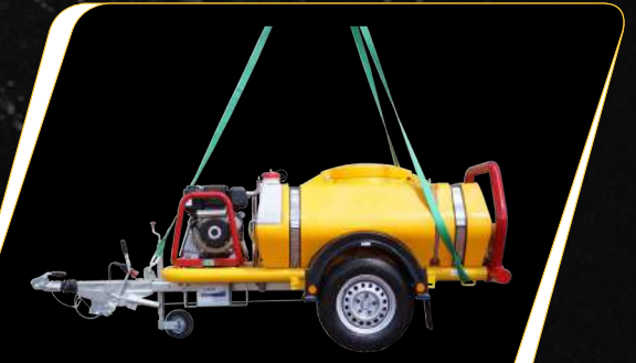
3 Point Lifting Points