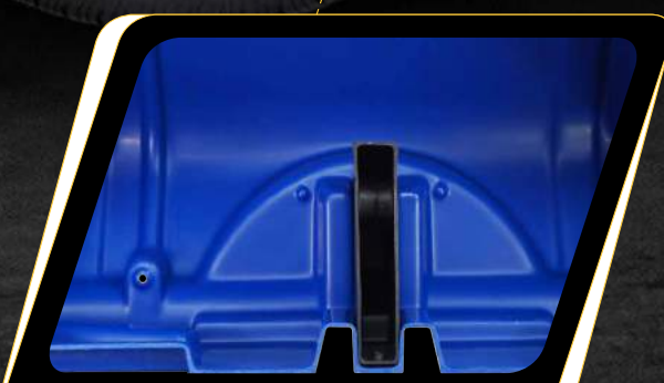
10mm Thick & Baffled Tank